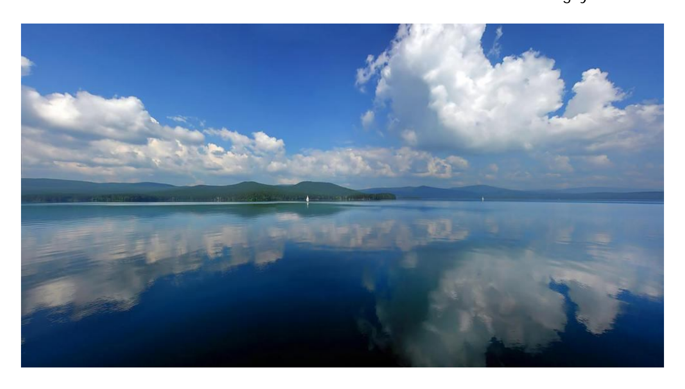
4:00 – return to Neptun Hotel in Miass